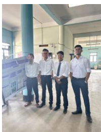
Position 2 : Group No.8