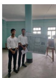
Position 2 : Group No.20