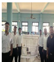
Position 3: Group No. 9