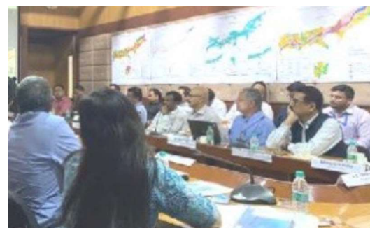
Meeting at ASDMA Office, During Final Report Submission, 10th of March, 2023