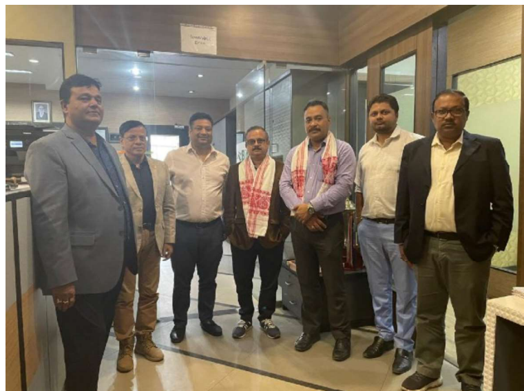
CED Faculty Members with BitChem Officials