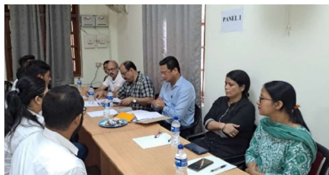
Project Viva of B.Tech. 8th Sem., 2023