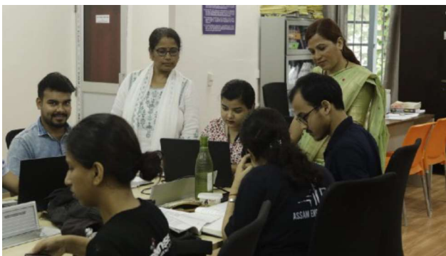
Students Engagement in CAD Centre cum Library in CED