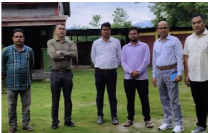
CED team with the members of the School Management Committee and ASDMA officials