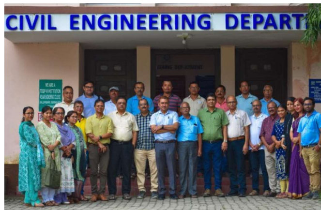
CED Family Members