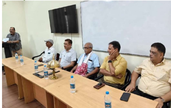
Farewell and Felicitation Meeting in CED