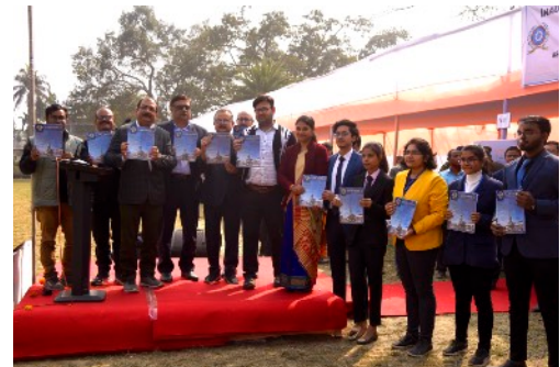
CED Faculty Members along with Students during the Inauguration Ceremony

The 11th issue of the Annual News Letter of CED, AEC was inaugurated on the College Foundation Day, 25th January, 2023.